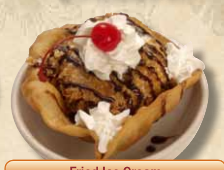
Fried Ice Cream Vanilla ice cream covered with a crunchy coating, deep-fried and topped with whipped cream, chocolate and cinnamon – 4.25