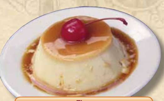
Flan Traditional Mexico City-style crème caramel custard. Baked fresh daily – 3.50